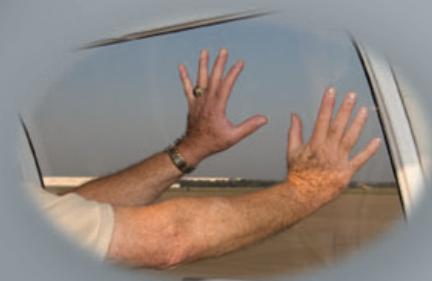
Cabin/Passenger Emergency Exit